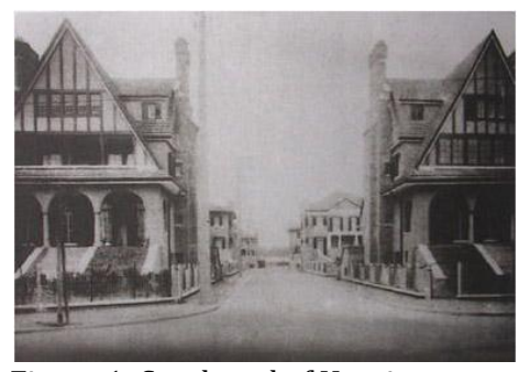
Figure 1: South end of Huating Street in 1920s.

its north end, and Huaihai Rd, former Avenue Joffre to its south (see Figure 2 for Huating Street's location). In a relatively long period since 1921, Huating Street was sided by garden houses and neo-Lilong row houses, inhabited by wealthy Chinese families in the French Concession. With the fled of