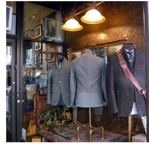
Figure 7: Window display of By Robert James on 72 Orchard.