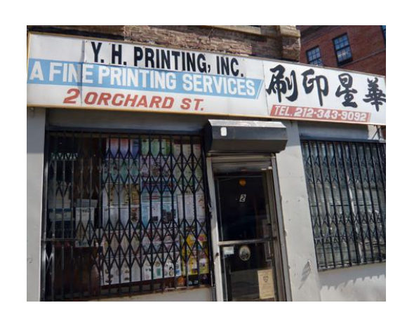
Figure 10: Printing Shop at the corner of Orchard and Division Street.

The BID president stressed that "(LES) is like a small town in a large, cold city; here everyone