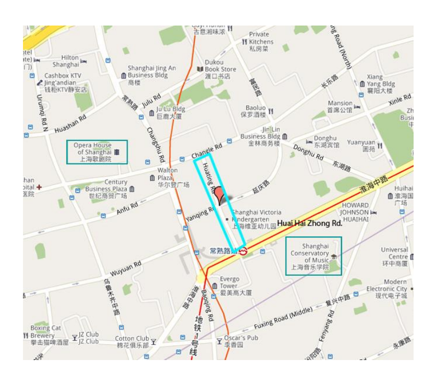
Figure 2: Huating Street and its neighboring area. Produced from Google Map, 2011.

During the Cultural Revolution (1966-76),the second-hand surprisingly prospered market against the broader anticapitalism ideology, rather than been banned. During the heyday of confiscating family possessions, more used goods appeared on the market, which attracted more treasure-hunters.