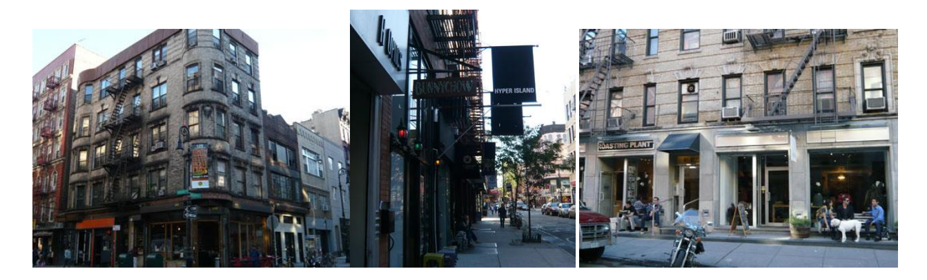
Figure 6: Orchard Street, between Grand and Broome.

Once of cherry and apple orchard, and later crowded by pushcarts selling cheap clothes and household appliances in the early 20th century, Orchard Street in the Lower East Side of Manhattan now hosts Sunday Bargain Event on the north of Delancey Street, Lower East Side Tenement Museum, and emerged as another art gallery destination, not to mention the LES has been "hipificated" in the last several years (Figure 6). Orchard Street has been for more than a century shaped by immigrant or urban resettler groups moving into the neighborhood, and the types of businesses catering to their needs. Like the relation of Huating Street to the former French Concession in Shanghai, what has been happening to Orchard Street characterizes the changes in the Lower East Side. "For decades, there was a discount men's suit shop at 183 Orchard Street. Then, in 1995, came Kush, a stuccoes Moroccan-themed bar. Then the bulldozers. And now, the 18-story Thompson Lower East Side hotel is rising on the site. That four-part history of one address — from shmattes to