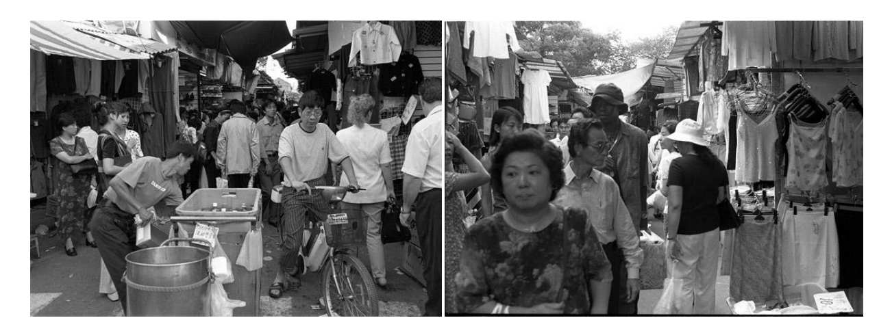
Figure 4: Huating Street in the late 1990s.

Street contributed more than 31 million yuan tax, while accumulated significant symbolic capital." <sup>3</sup> (See Figure 4 for a typical scene on Huating Street)