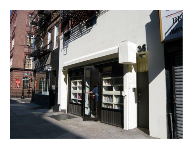
Figure 9 Miguel Abreu Gallery on 36 Orchard.