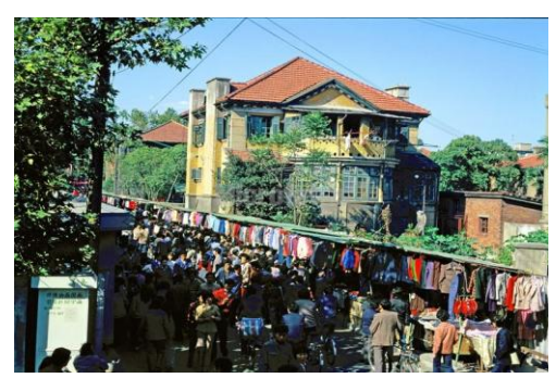
Figure 3: Huating Street in the 1980s.

At the beginning, the small merchants on Huating Street got their merchandises from coastal areas in the south like Shishi, Xiamen, and Shenzhen. Later they tried the strategy to brand the merchandises "exports for domestic sale" – play on the public's perception that goods for export are of relatively